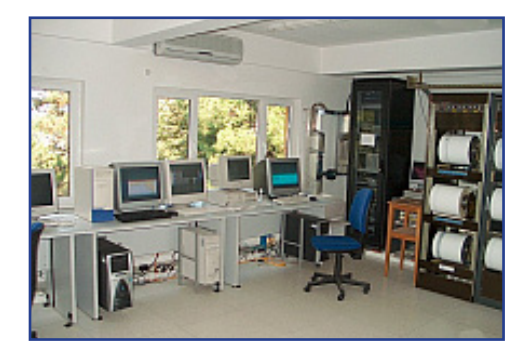
Secondary data centre

Another solution using GeoSIG products and a capable partner providing quality and reliability can also be cost effective.